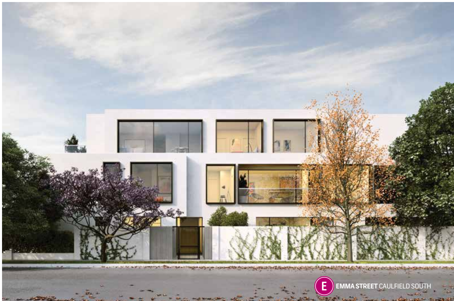
E EMMA STREET CAULFIELD SOUTH

The kitchen also honours the Nordic aesthetic. Generous storage space is provided through expertly designed cabinetry, influenced by the latest Danish design trends. The material palette is similarly neutral in colour, to allow for the space to be dressed to personal taste. The kitchen opens seamlessly into the lounge room and outdoor area to create a sense of space and open-plan living.