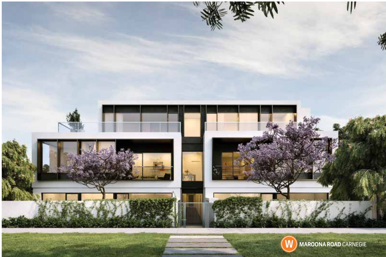
W MAROONA ROAD CARNEGIE