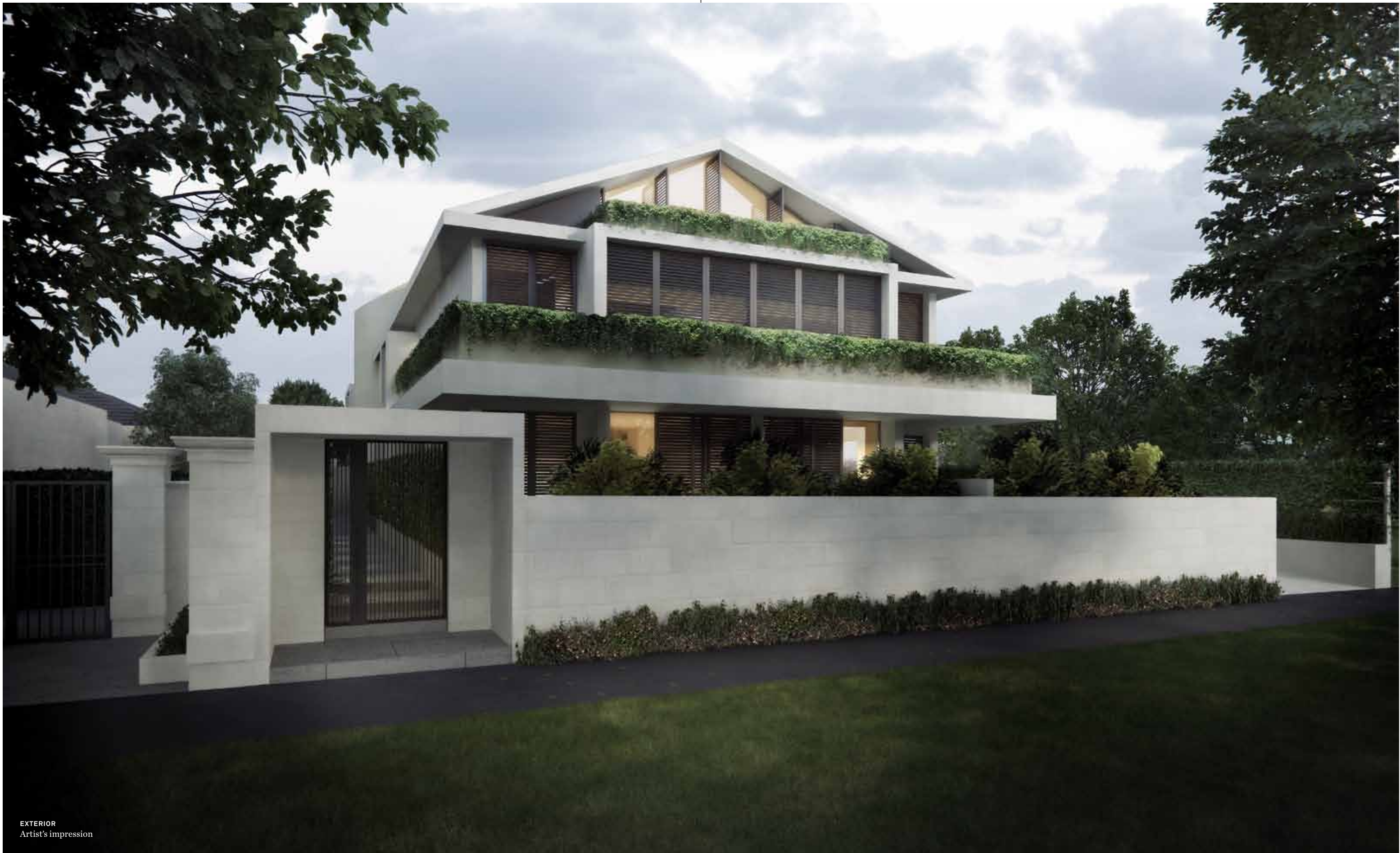
EXTERIOR Artist's impression