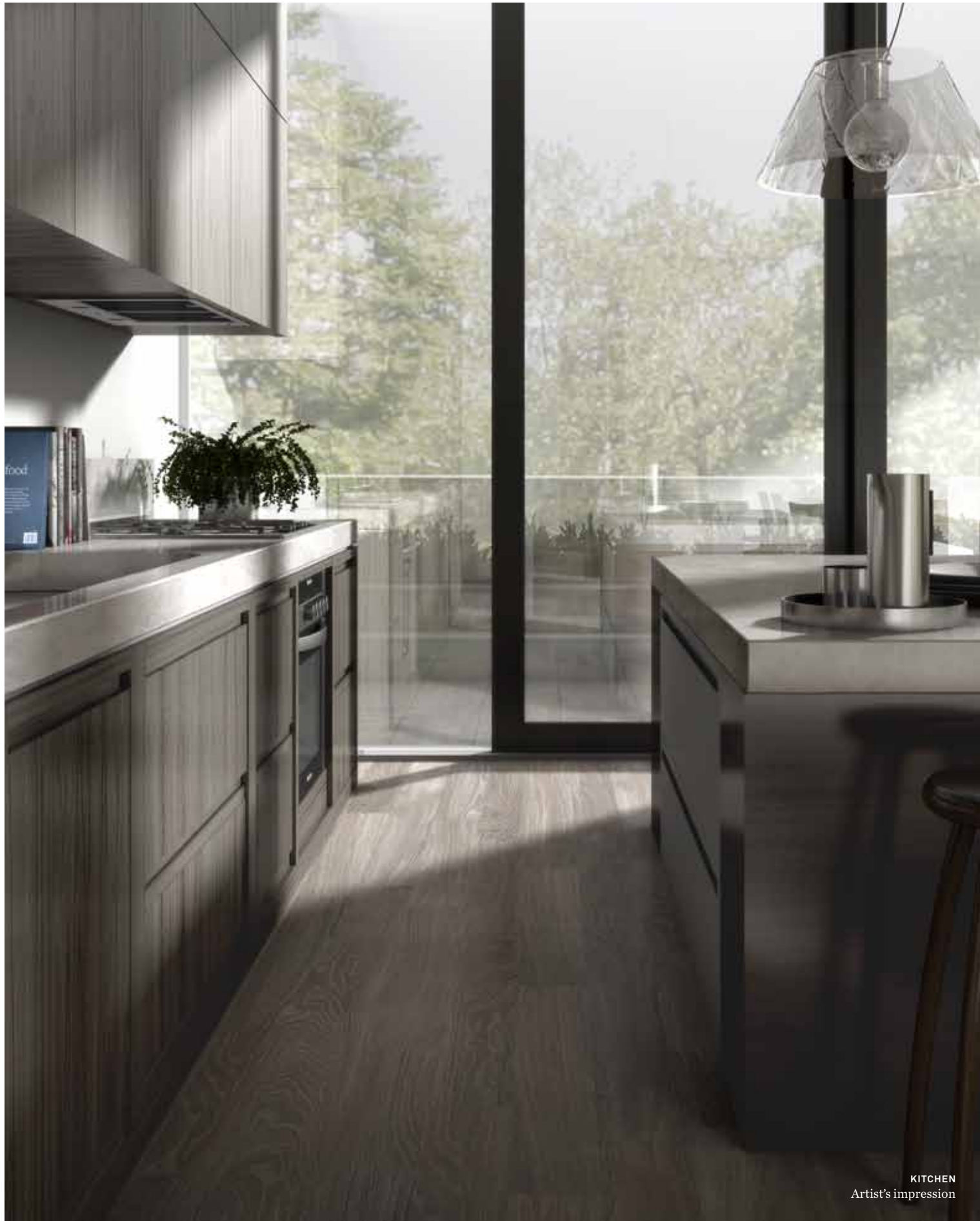
KITCHEN Artist's impression