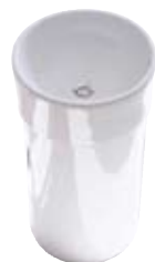
ITEM || VANITY BASIN LIVES IN || ALL BATHROOMS

The unique Italian design free-standing basin is a beautiful feature piece in the bathroom, powder room and master ensuite. Its simple cylindrical column design has a gradual, slight tapering to the top. The clean lines and gleaming white finish accent the minimalist beauty of this floor-mounted vanity.