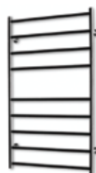
ITEM || HEATED TOWEL RAILS LIVES IN THE || ENSUITE/BATHROOM

Step out of your hot shower and stay warm with an evenly-dried, fluffy heated towel. Combining a sleek clustered design for enhanced drying, it brings together style and function to create the ultimate bathroom accessory.