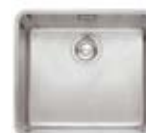
ITEM || LAUNDRY TROUGH LIVES IN THE || LAUNDRY

The vanity tapware offers a brilliance, clarity and harmony to the ensuite. Adding the ultimate in personality and design style with its luxurious form and stainless steel finish.