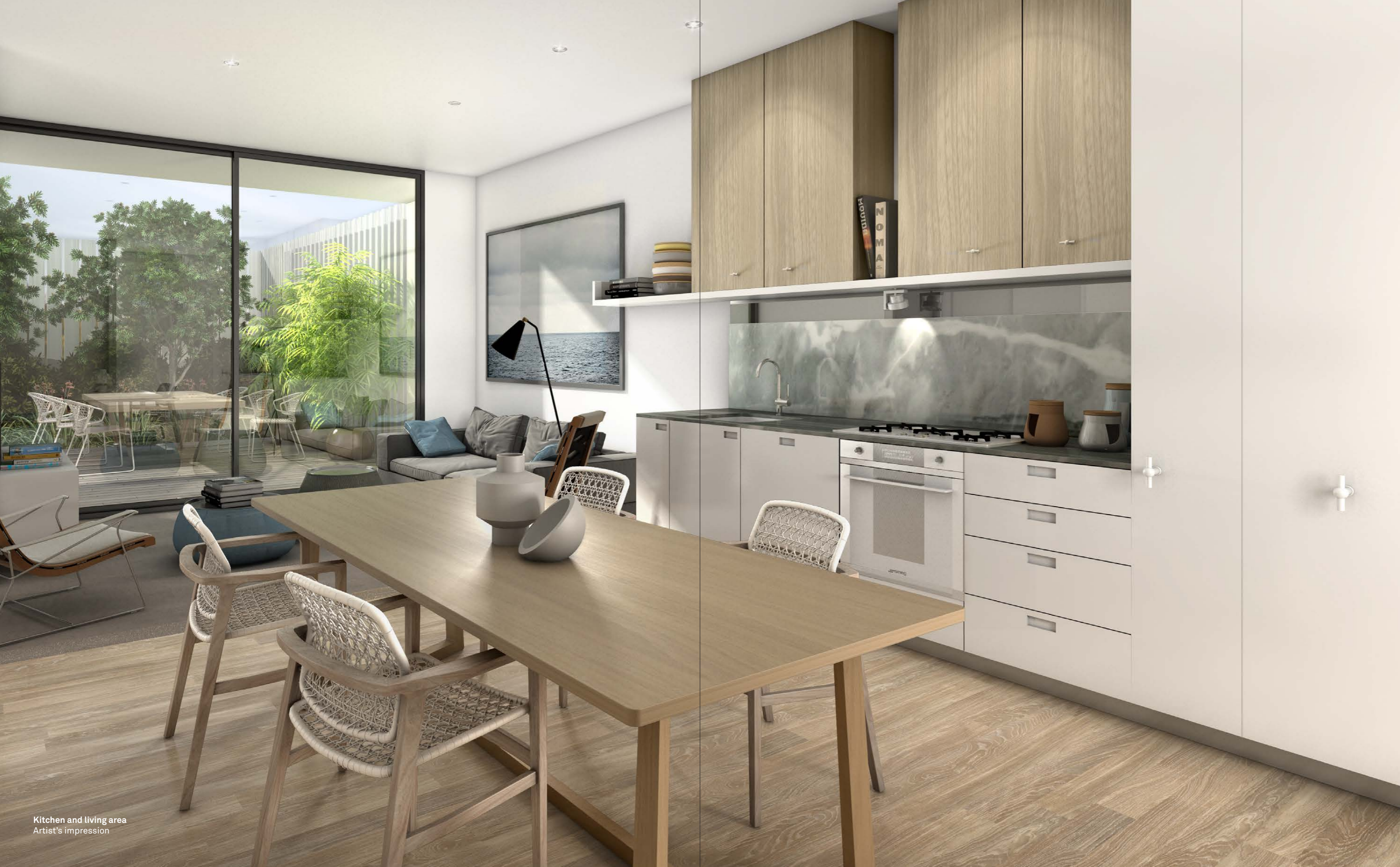
Kitchen and living area Artist's impression