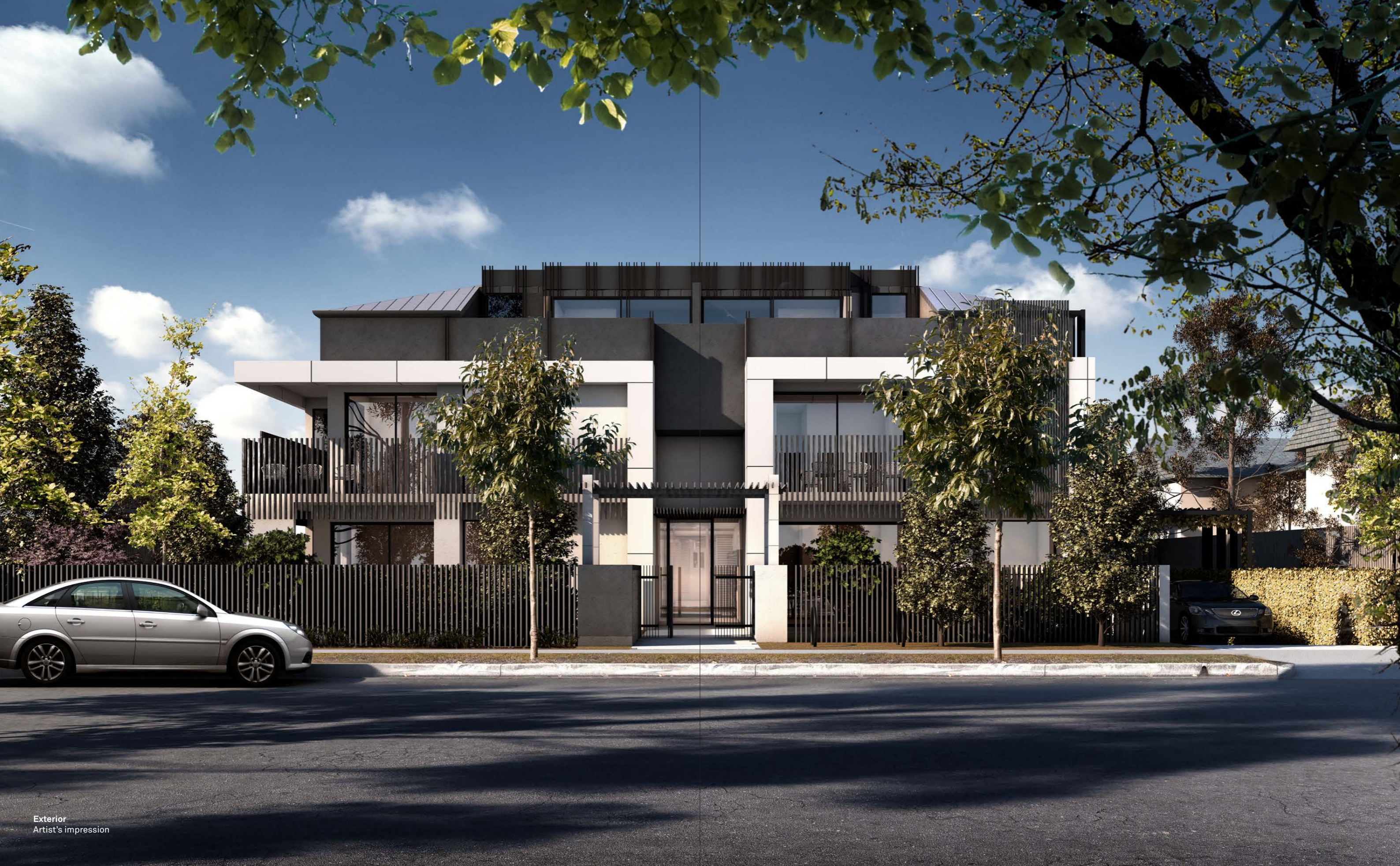
Exterior Artist's impression